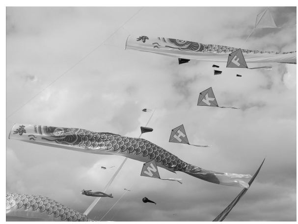
Issue 1. Copyright White Horse Kite Flyers (2009)