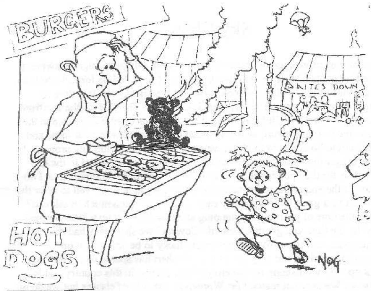
Arthur's worst nightmare